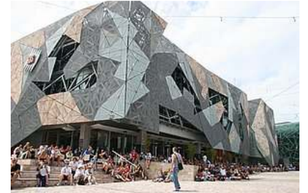
Federation Square, Melbourne and BMW