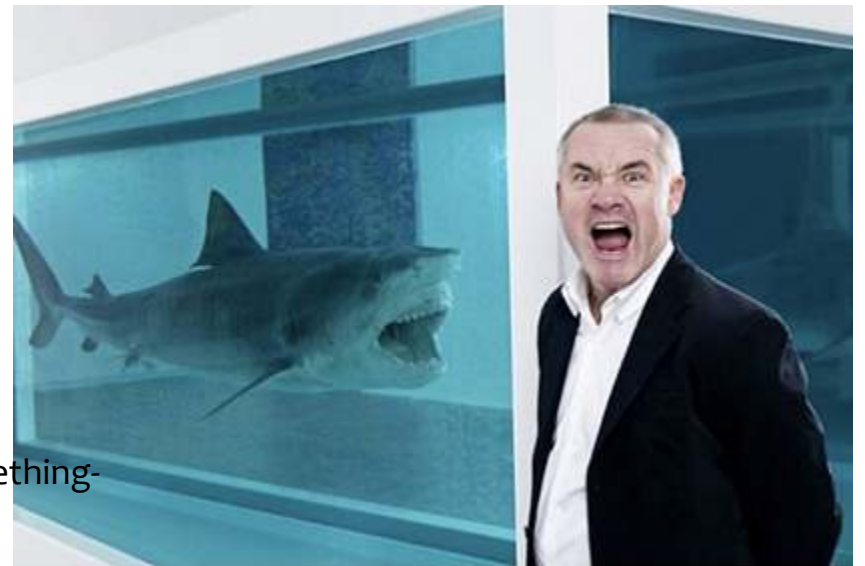
Damien Hirst, English Artist “Is He Ingenious Or A Creative Marketing Something- Else?”