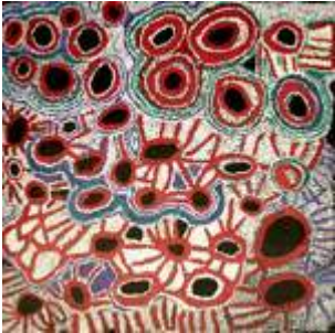
One Toyota Art - Aboriginal Art, Western Australia