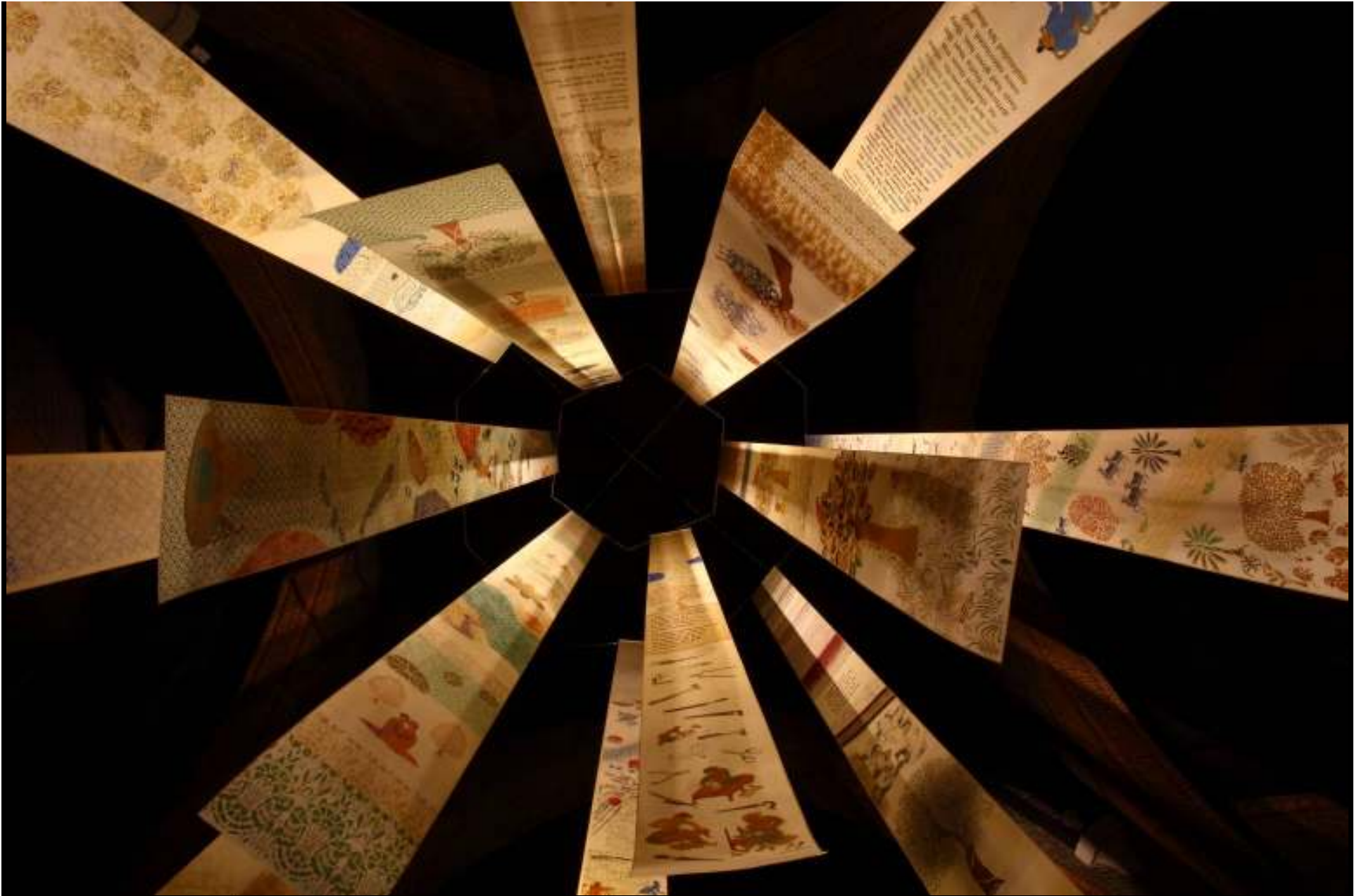
Nilima Sheikh, Over Land , 2010