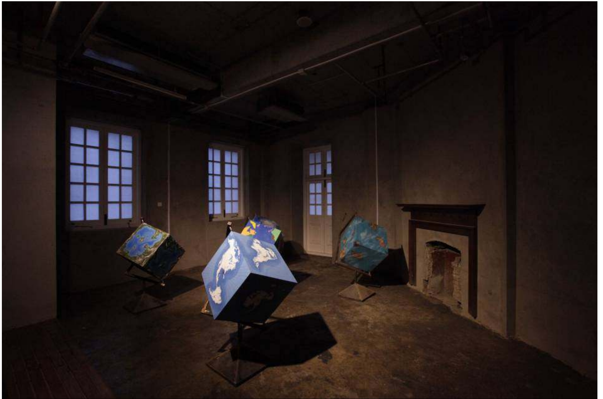
Qiu Anxiong, Cubic Globes , 2010