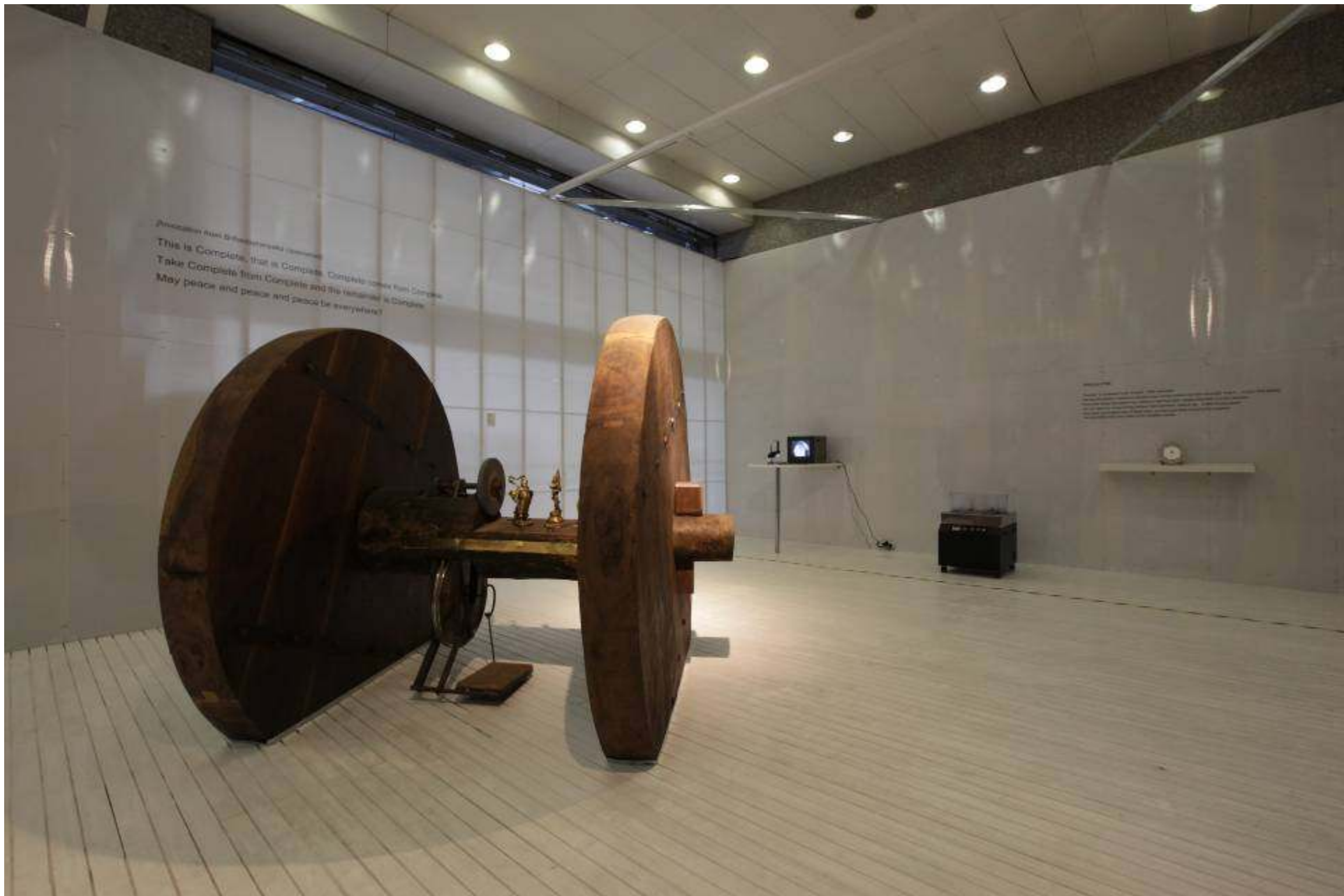
L N Tallur, Enlightenment Machine (Beta Version) , 2010