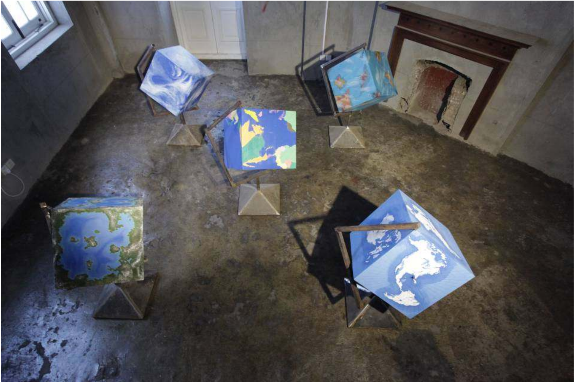
Qiu Anxiong, Cubic Globes , 2010