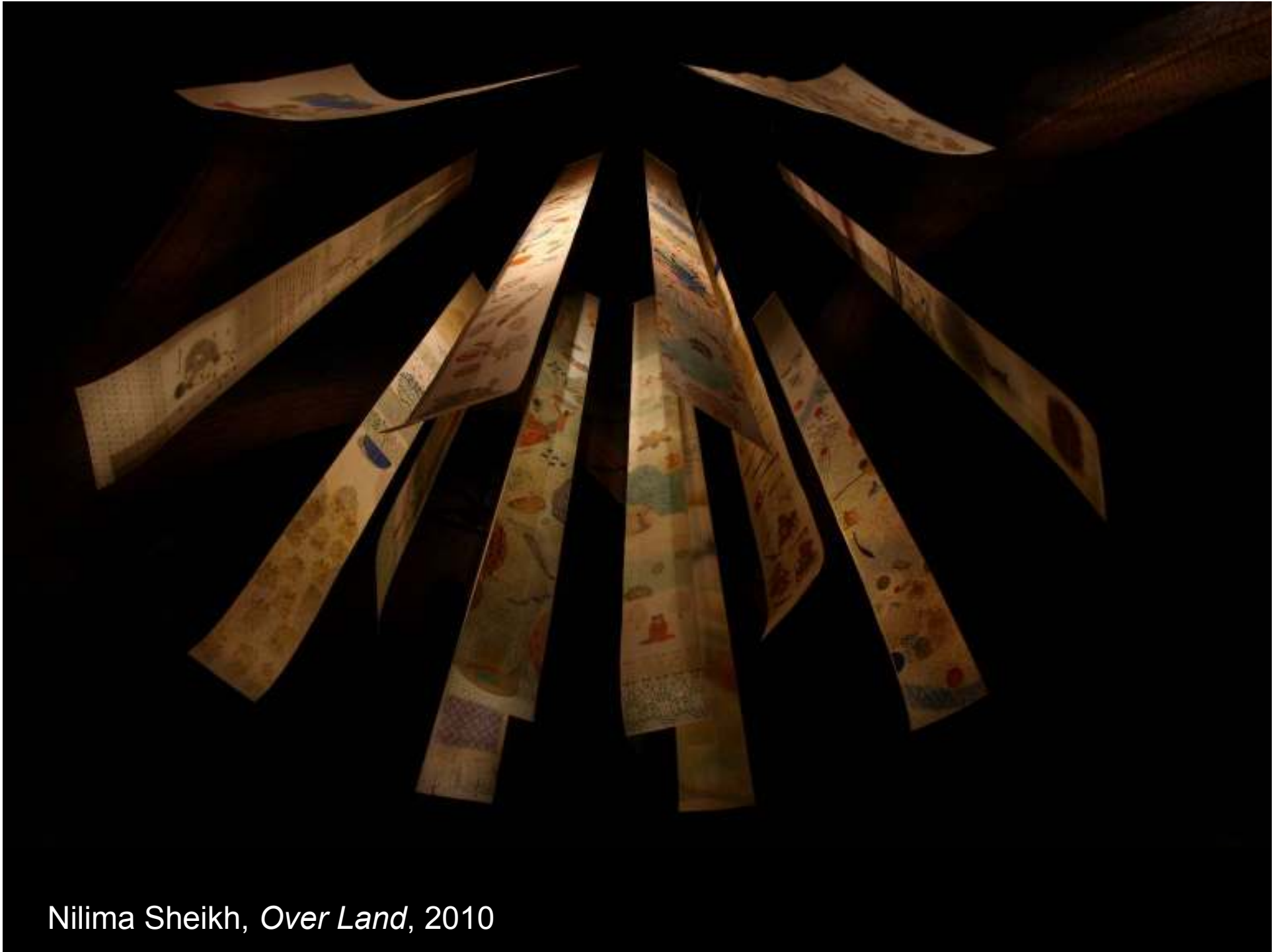
Nilima Sheikh, Over Land , 2010