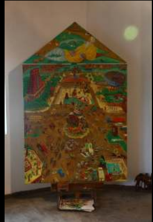
Liu Dahong, Travelling Worldwide , (work in progress) 2010