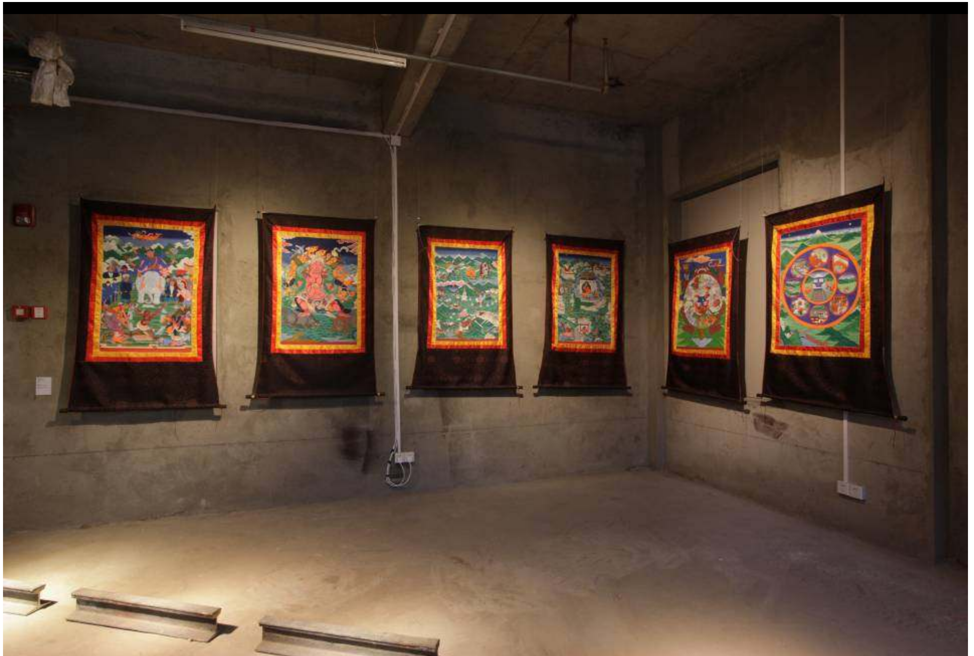
Qiu Zhijie, Railway from Lhasa to Kathmandu , 2010