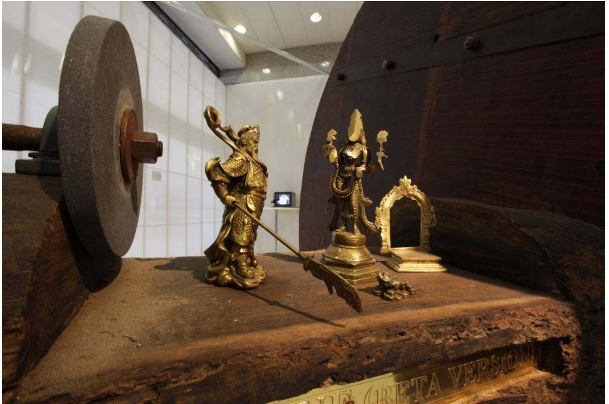
L N Tallur, Enlightenment Machine (Beta Version) , 2010