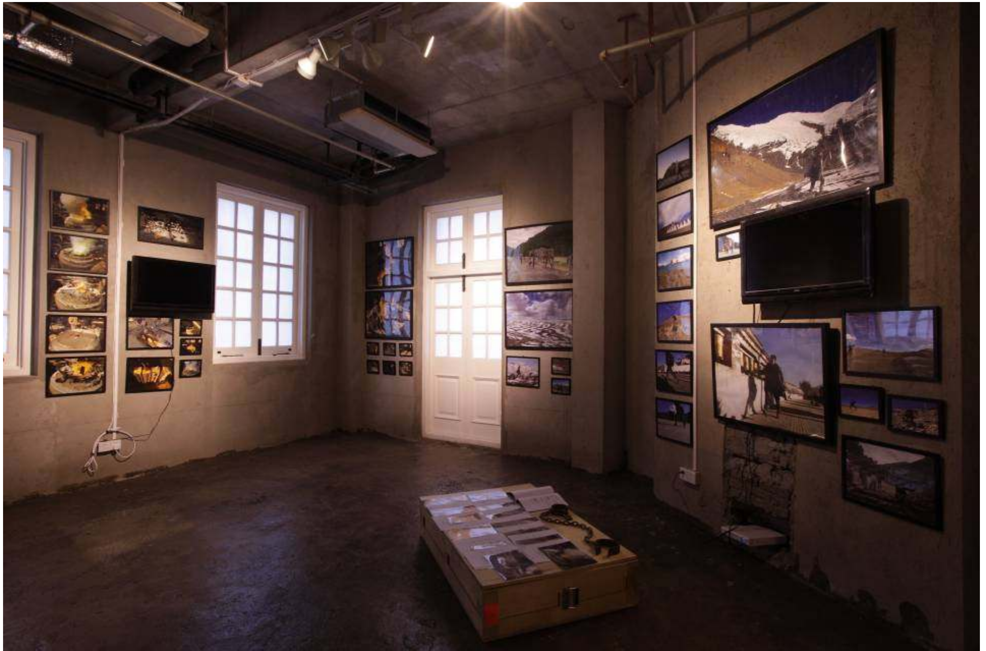
Qiu Zhijie, Railway from Lhasa to Kathmandu , 2010