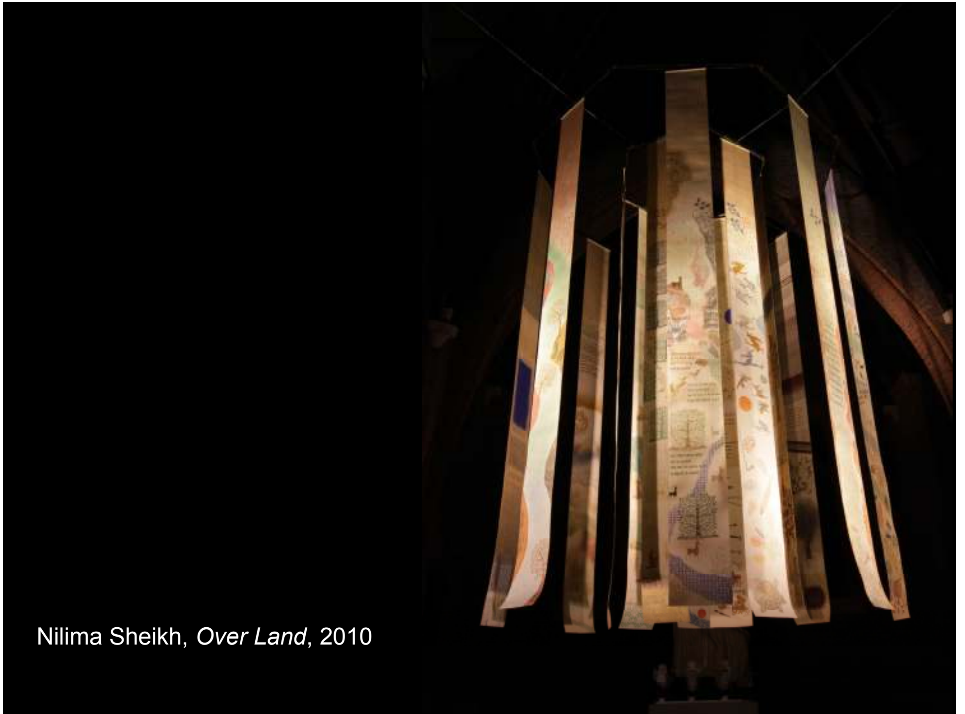
Nilima Sheikh, Over Land , 2010