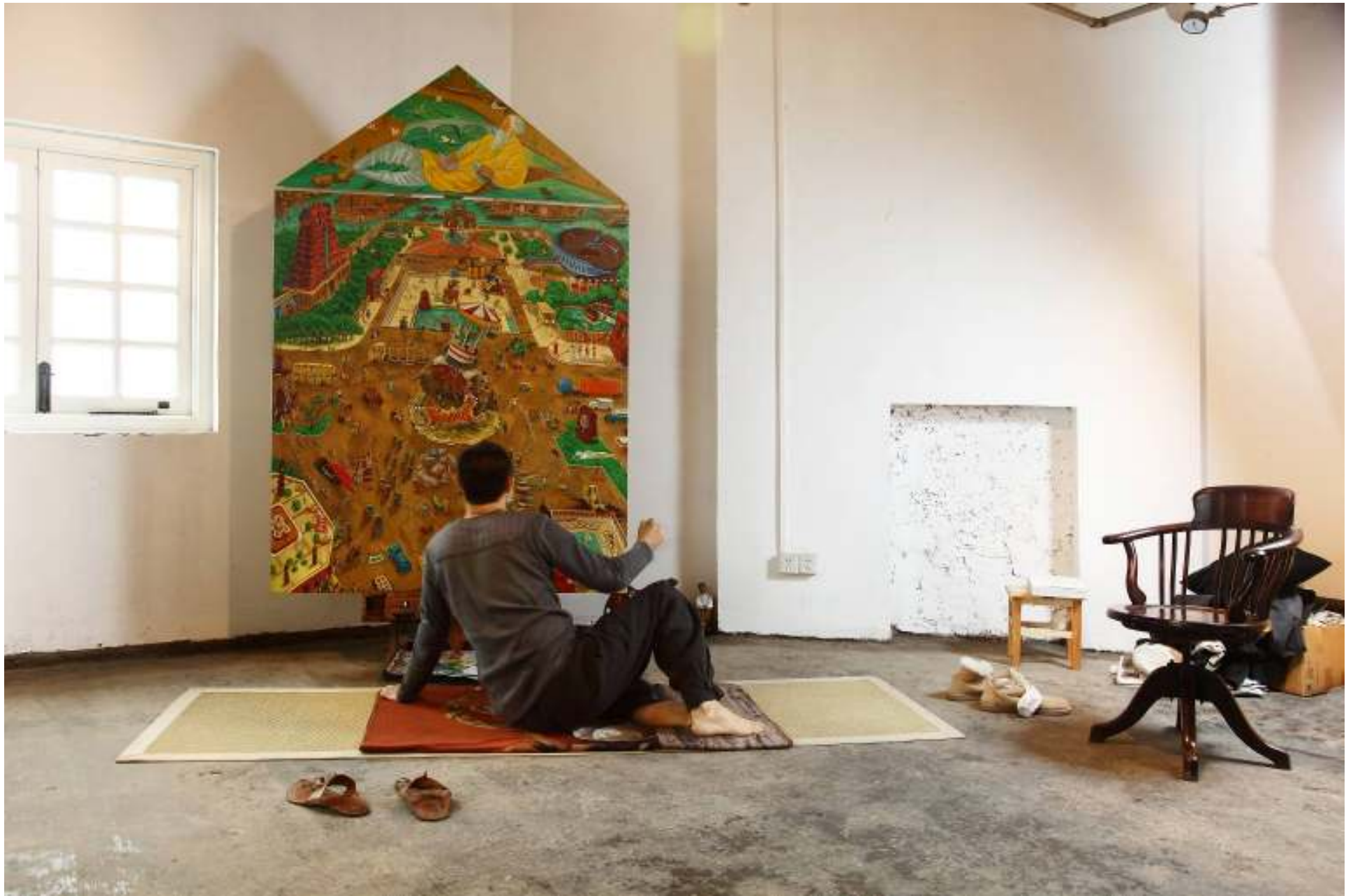
Liu Dahong, Travelling Worldwide , (work in progress) 2010